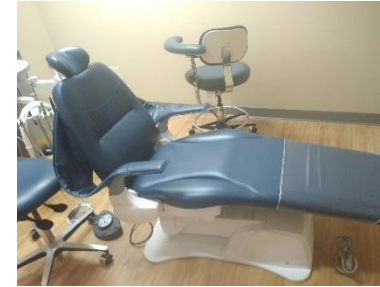
The hygienist will call your name and walk with me to a room with a cool chair.