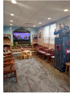
Until they call my name, we will play games and watch TV.