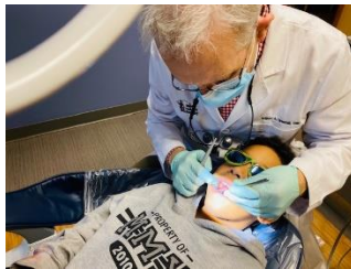
The dentist will count each of my teeth.