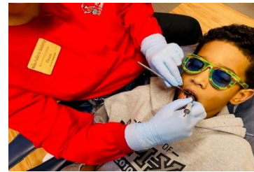
Then, she will clean my teeth with special tools.