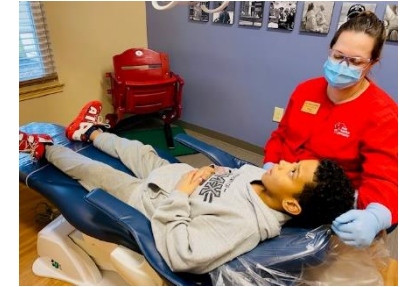
I'll get in the chair with my legs straight and my hands on my stomach.