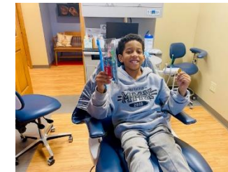
At the end of my visit, I'll get a toothbrush and a prize!