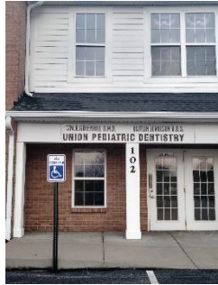
It's time to visit the dentist!